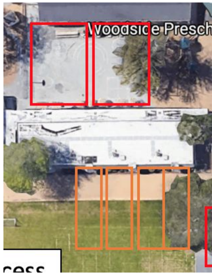
Orange areas for TK & K students